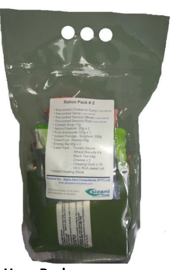
24 Hour Pack